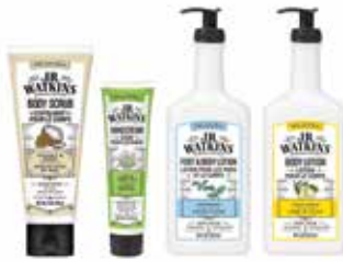
REMEDIES FOR BODY™ by J.R. Watkins pages 15-21