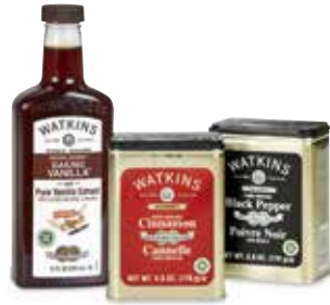
GOURMET pages 3-14

All of the above Points of Superiority make up THE WATKINS WAY, and you will agree that it is a good way.