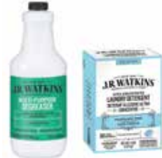
REMEDIES FOR HOME™ by J.R. Watkins pages 22-23